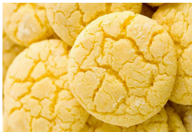
Ballokume

The joy that comes from breaking that thick cookie and biting down to that soft center is like no other. Although we can't celebrate Dita e Verës in person, we can still spread the joy of making and eating ballokume. Here's my family recipe for ballokume.