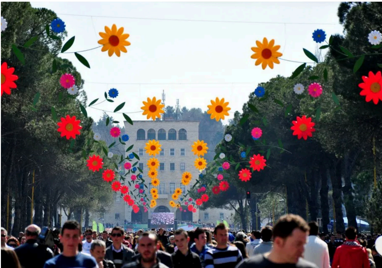
Spring is in the air! Dita e Verës!

8 eggs 500 grams of butter 1 kg sugar 1 kg of corn flour A handful of corn starch Milk that fills up half an egg shell