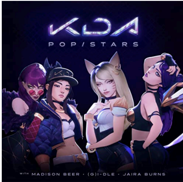
POP/STARS Album Cover

champions (playable characters), consisting of Ahri, Evelynn, Kai'Sa, and Akali. The main voices behind Ahri and Akali are members of real life K-pop group (G)I-DLE, with Mi-yeon voicing Ahri, and Soyeon voicing Akali. Evelynn and Kai'Sa are mainly voiced by Madison Beer and Jaira Burns. As they're four of the most popular champions played, clearly it was very popular with many fans.