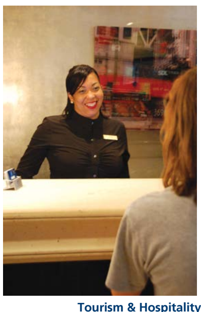
Tourism & nospitam

Tourism & Hospitality | TAH with concentrations in Food and Beverage Management, Hotel Management, Tourism